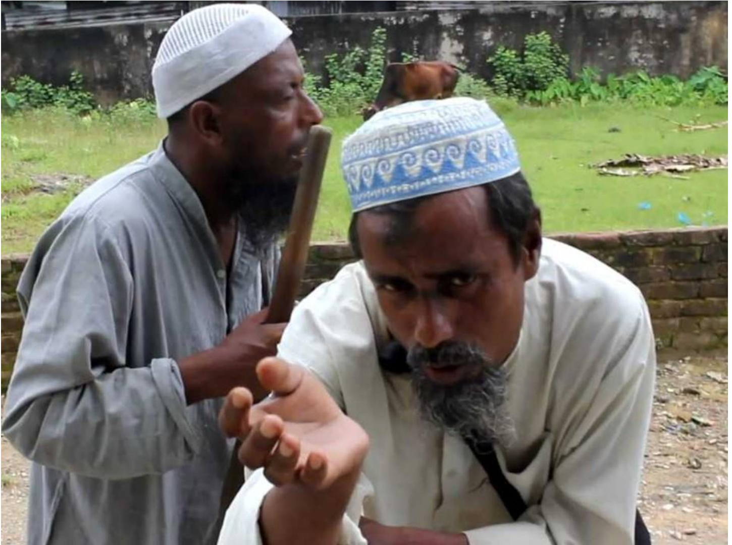
Story of Blind Bartemaeus

This means we have to take action. Yes, God loves us and desires to comfort us. But, the free will that we were created with means that God does not force himself on us.